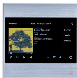
trivum TouchPad (optional)